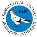
Bulgarian society for the protection of birds