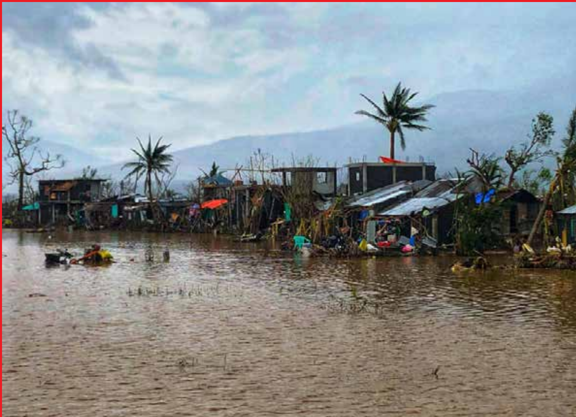
Typhoon Goni, Province of Malinao, Albay province, Philippines, November 2020.