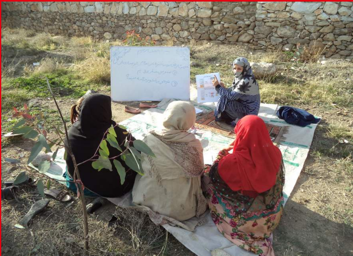
The midwife of Nawdamorra Sub Health Center in Laghman province, Afghanistan, conducted an awareness session on COVID-19 to sensitise the women in the community.

2021 was a year of important contribution to the localisation agenda and bringing faith and social justice perspectives to address inequities in access to Covid-19 vaccines and treatment.