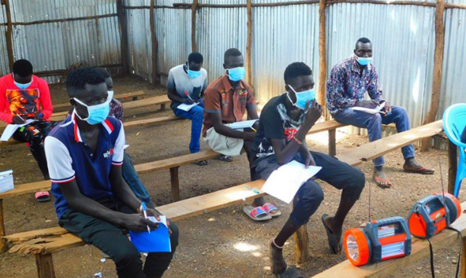
ACT Africa hosts vaccine seminar

and the knowledge and technology necessary for production and manufacture locally. The statement articulated donor action necessary to address vaccine inequities alongside recognition of challenges within the African region related to hesitancy and supply issues.