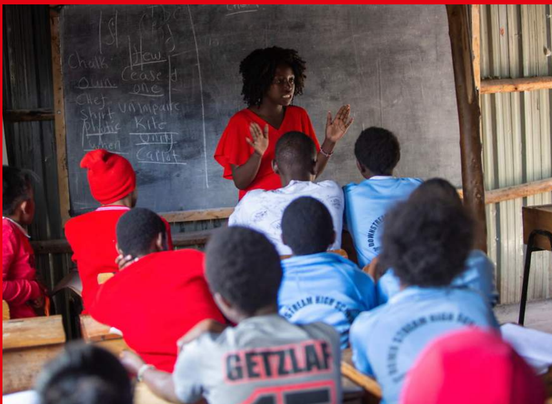
Classroom in Kenya.

2021 was a year of success and consolidation for Development Policy and Practice (DPP). The results we achieved on major decision and negotiation processes will have an impact on EU support to human development and the role of civil society in the coming years.