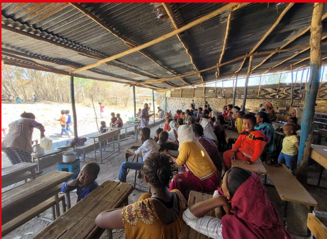
Famix distribution by EECMY LWF sitrep 'The mothers of Ayder' — LWF Ethiopia / EECMY