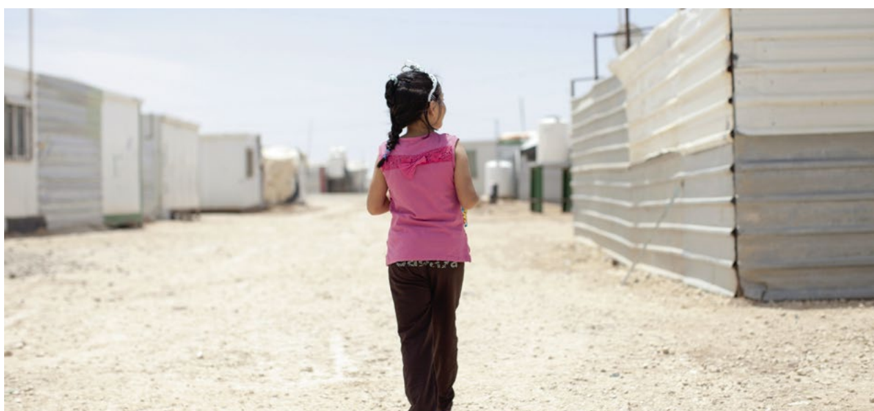
Girls and women are particularly vulnerable to many of the risks that social protection helps people to mitigate, such as poverty and violence, as well as risks related to sexual and reproductive health and rights. The image depicts the Church of Sweden's humanitarian efforts in Jordan.

Recognise and value unpaid care and domestic work through the provision of public services, infrastructure and social protection policies, and the promotion of shared responsibility within the household and the family as nationally appropriate.