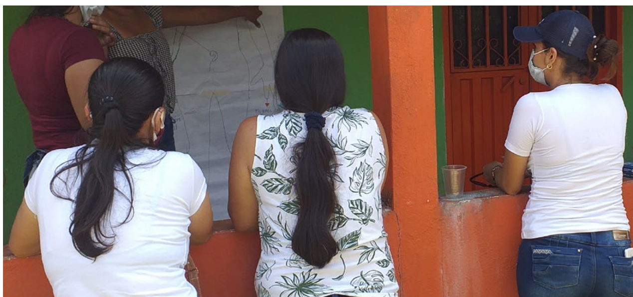
Many of the organisations that Kvinna till Kvinna and Act Church of Sweden collaborate with testify that women's exposure to violence increased during the Covid-19 pandemic. The image depicts Act Church of Sweden's humanitarian work in Colombia.

Means-tested support will always be needed as a complement, but universal systems that include everyone should be the norm, with clear categories of target groups such as children, the sick, persons with disabilities and older persons. Such systems are generally popular, thus increasing the chance of public support both for long-term financing and for maintaining high quality. At the same time, conditions for social trust and a functioning social contract are strengthened. An important advantage of establishing clear categories for who are entitled to various benefits is that people then can understand for themselves whether they have the right to such benefits or not, which then also reduces the risk of corruption.