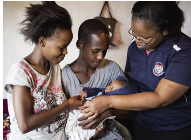
Social protection improves parents' ability to have their children vaccinated and to ensure that they go to school. It is usually not a lack of will that prevents them from doing this. The image shows Act Church of Sweden's work with mentor mothers in Eswatini.

However, many social protection programmes introduced in developing countries in recent years may have reinforced traditional norms about women's main responsibilities for children and have rather increased the workloads of women. This has happened primarily when cash transfers are made conditional to certain behaviours. Several studies show that regular cash benefits do have positive effects on school attendance and vaccination rates – regardless of whether these are required conditions for receiving support or not. However, if the benefit is conditional on school attendance this can be counterproductive and increase women's workloads.